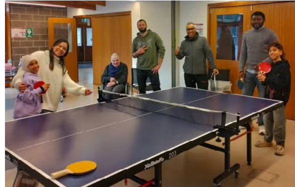
Table Tennis is going strong every Wednesday evening between 18:00 and 20:00 community get together for a fun game of table tennis.